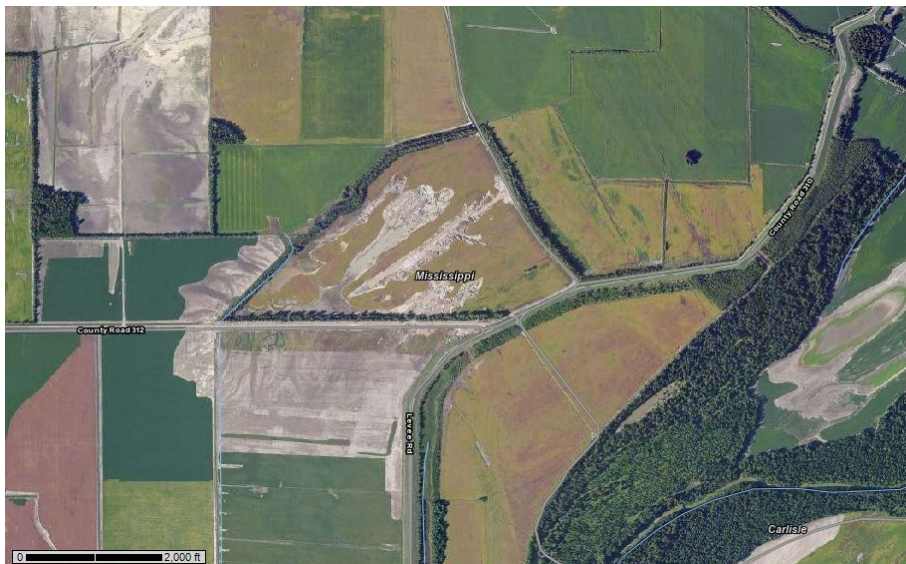
Figure 5. 2011 Aerial view of O’Bryan Ridge gully fields and scouring extending under road and into the levee and drainage district land after 2011 USACE induced levee breaching at Birds Point New Madrid Floodway.

Ridge ( Figure 5 ) a former meander bank about 2 to 2.5 m (6.6 to 8.3 ft) high. Floodwaters then flowed over O’Bryan Ridge which is about 10 km (6 mi) long and approximately 1 km (0.6 m) wide [16]. As the floodwater spread across the 2010 soybean residue in the fields of O’Bryan Ridge, rapidly moving water scoured the land surface before dropping to the first bottom on the west side of the ridge.