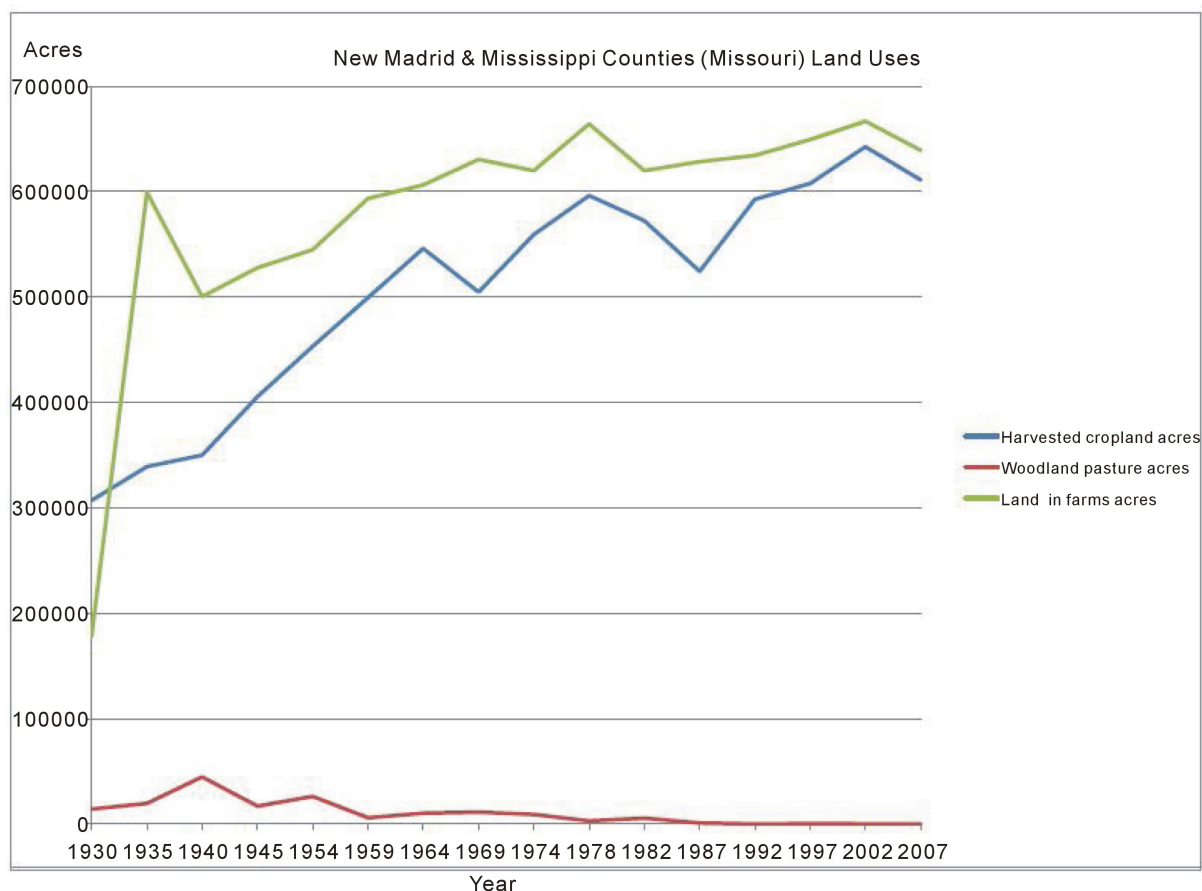
Figure 2. New Madrid and Mississippi Counties (Missouri) land uses USDA census of agriculture 1930-2007 [28].

early summer after saturated and flooded soils have drained.