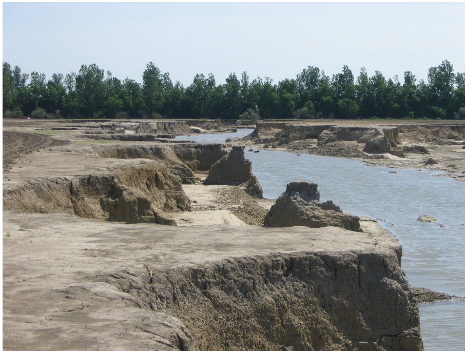
Figure 4. O’Bryan Ridge gully field, June 2011 after the May 2 nd USACE induced breaching of Birds Point—New Madrid levee.